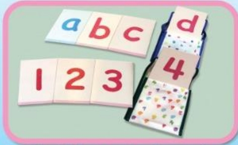
Tactile alphabets and number cards set 触觉字母和数字卡组合