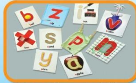
Alphabets reinforcement and skills development kit 字母强化及技能开展教材